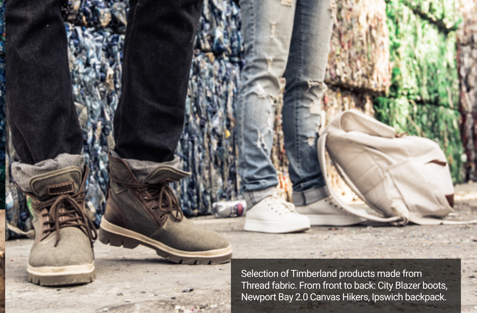
Selection of Timberland products made from Thread fabric. From front to back: City Blazer boots, Newport Bay 2.0 Canvas Hikers, Ipswich backpack.